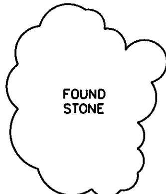
29" X 24" X 14" SANDSTONE